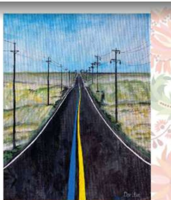
«THE WAY HOME»